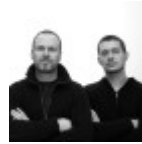
Tveit & Tornøe